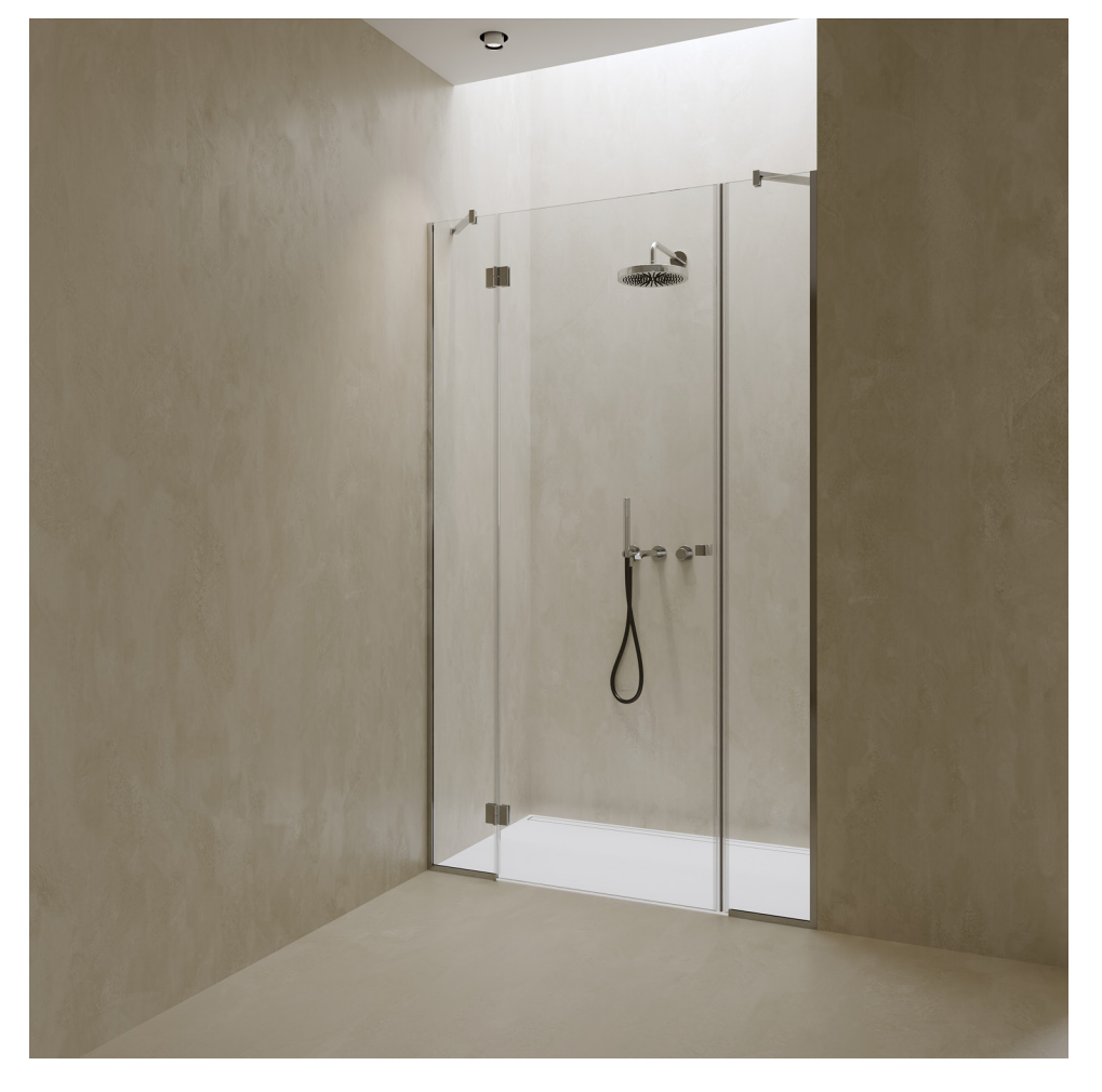
LIFT 04 Shower cabin in a niche with central pivot doors and two fixed glass panels.