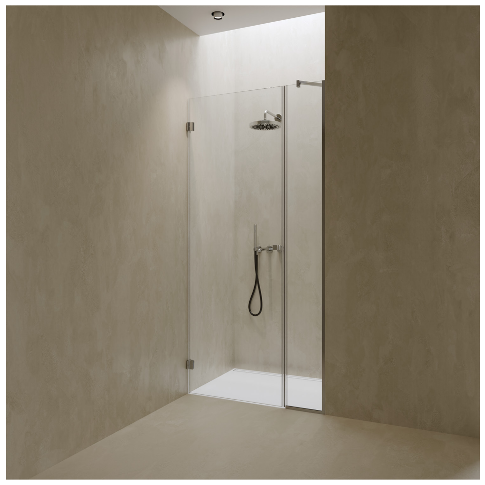
LIFT 02 Shower cabin in a niche with pivot doors, wall-mounted with fixed glass.