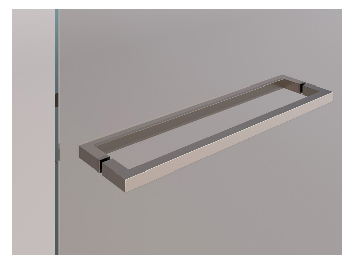
DOUBLE-SIDED TOWEL BAR