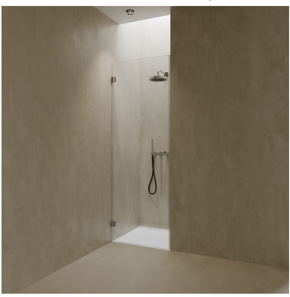
LIFT 01 Shower cabin in a niche with pivot doors, wall-mounted.