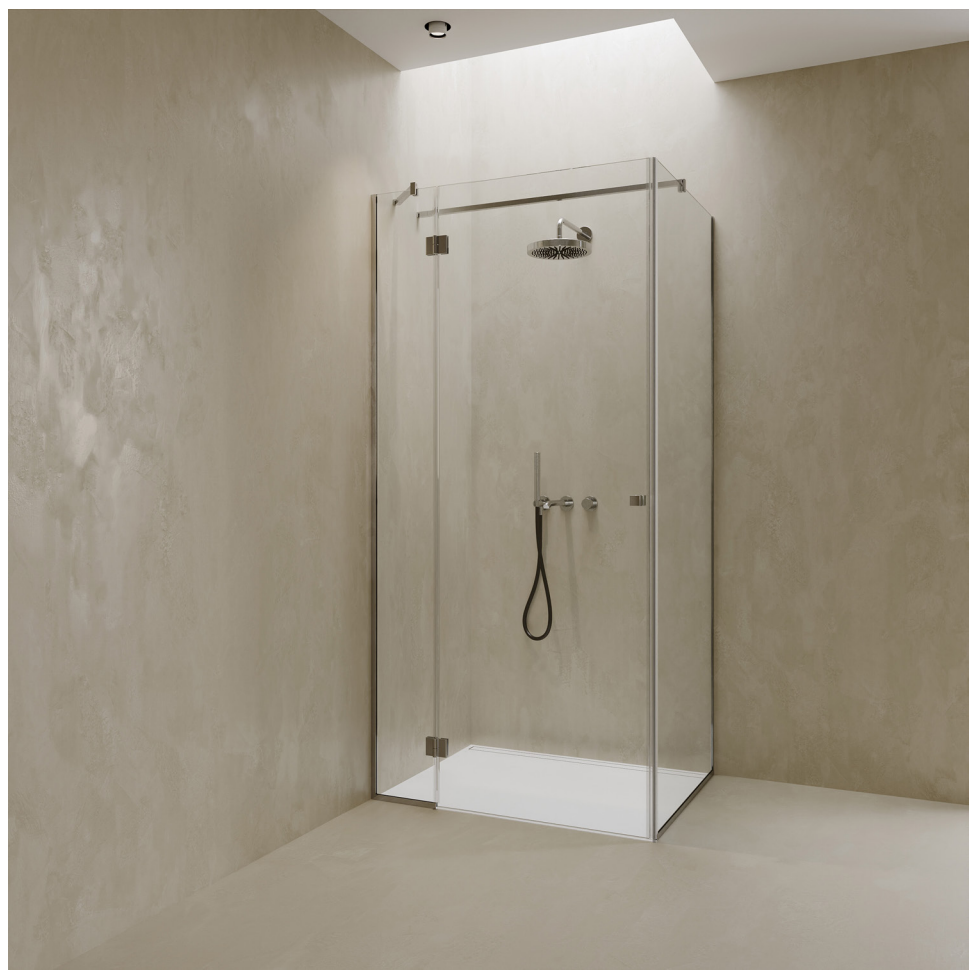
LIFT 06 Corner shower cabin with two fixed glass panels and one door.